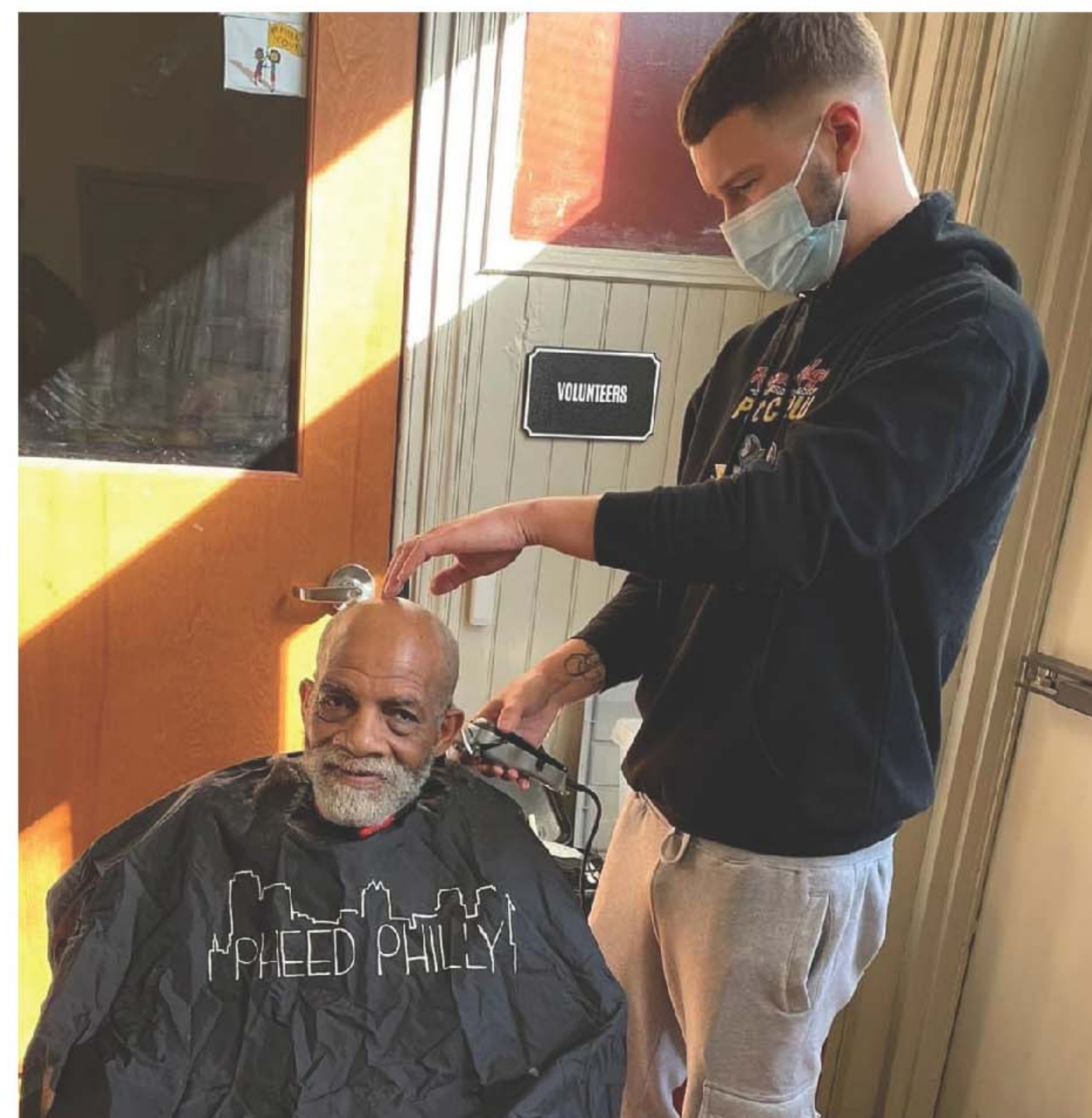
Volunteer Barber offers free haircuts once a month